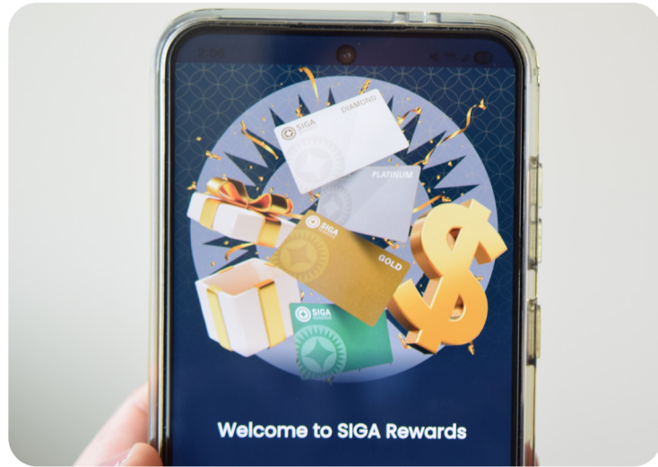
(SIGA Rewards membership requires users to be 19 or older. For more information, visit www.sigarewards.ca )

Northern Lights Casino received the SIGA Rewards Ambassador Award for outstanding member engagement and program growth. Their 17-member Guest Services team achieved consistent monthly increases in both tracked activity and new member acquisitions.