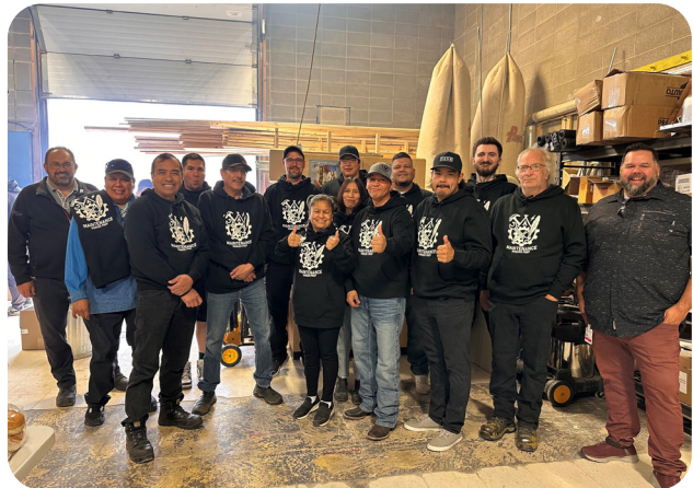
(There were 13 Maintenance Repair Workers from five SIGA Casinos that took the 12-week program.)

Successful completion of this program may enable SIGA employees future opportunities like apprenticeships in various trades.