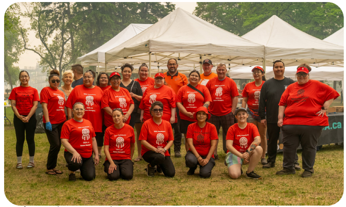
(Northern Lights Casino volunteers at the 2025 Heart of the Youth Community Pow Wow.)