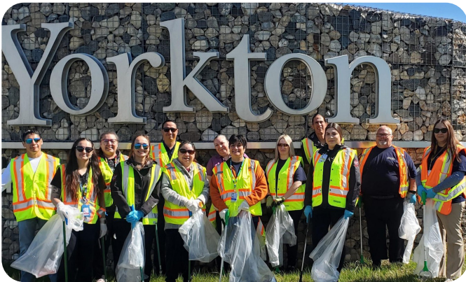
(Painted Hand Casino volunteers during a community cleanup in Yorkton.)