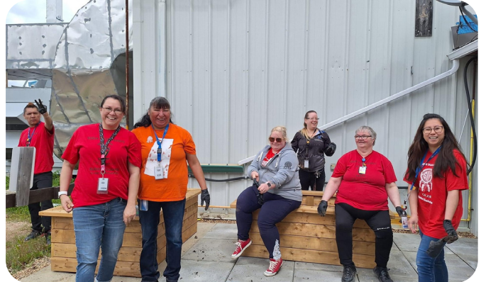
(Bear Claw Casino & Hotel volunteers pose for a cheery photo.)