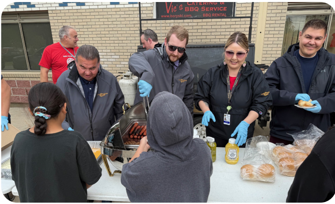
(Dakota Dunes Casino volunteers host a community BBQ at Charles Red Hawk Elementary.)