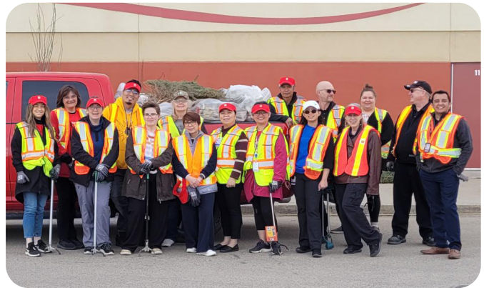
(Volunteers from Living Sky Casino during an Earth Day site cleanup.)