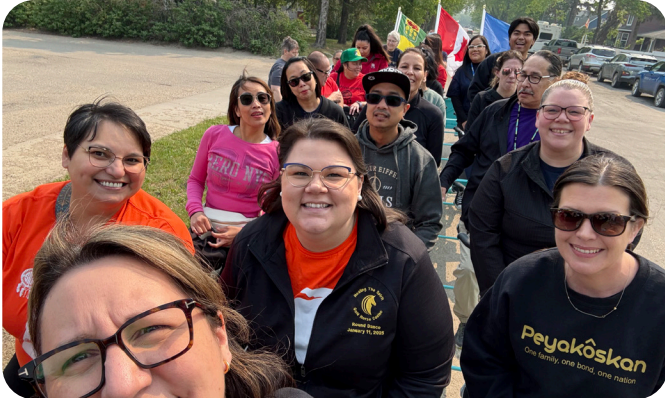
(Volunteers from Gold Horse Casino ride the Big Brothers Big Sisters MegaBike.)