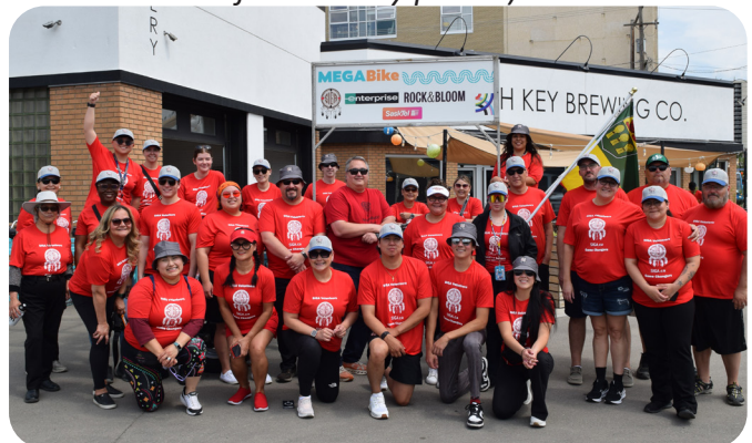
(Central Office and Dakota Dunes volunteers prepare to ride the MegaBike.)