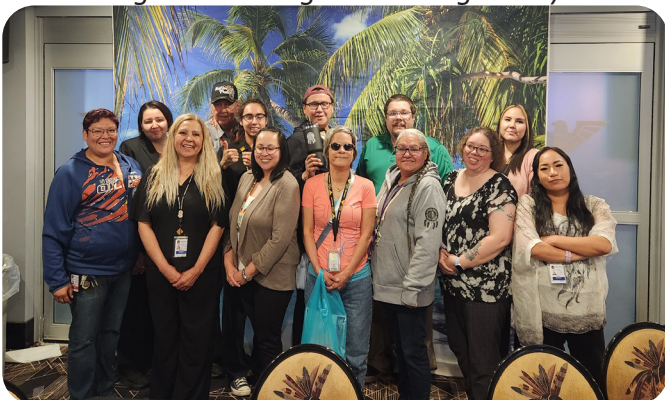
(Volunteer Appreciation Day at Gold Eagle Casino.)