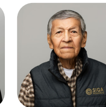
Chief Joe Quewezance Elder Yellow Quill First Nation