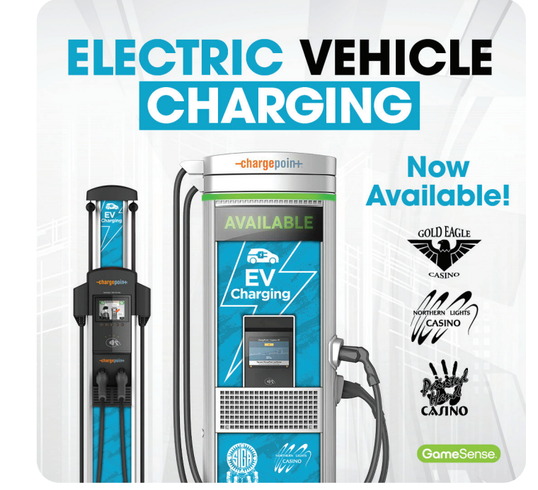
(Above: what the EV chargers will look like once installed.)

Phase 2 will see EV chargers installed at the remainder of SIGA's seven casinos over the course of the next 12 months.