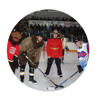
Battle of the Little Big Puck